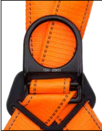
DORSAL D RING